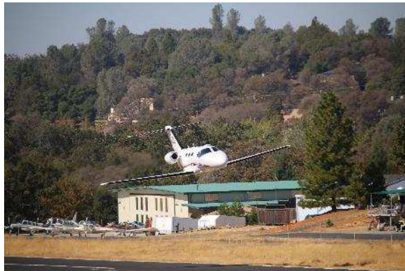
Alan's Citation Mustang jet