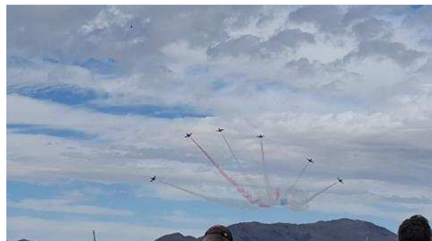
Patriots Jet Team at 2018 Reno Air Show

The Patriots Jet Team also performed at the Reno Air Races this year with a spectacular show.