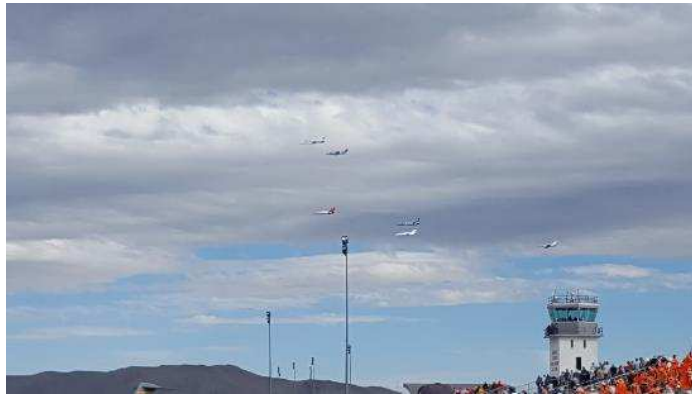
Jet race start at 2018 Reno Air Show