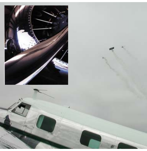
On Saturday, we viewed aerobatics from the Blankenburg's 1938 Lockheed