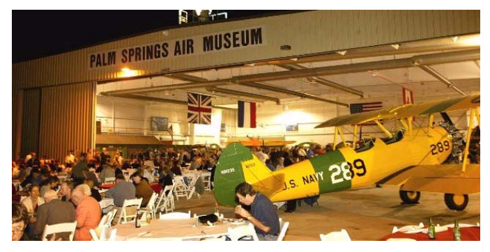
AOPA Expo 2002 was a superbly orchestrated extravaganza. Can't wait 'til the next one.