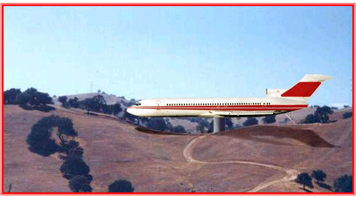
The Corsair Café is considering plans for a new wing at Pine Mountain Lake Airport

The cartoons on the December PMLAA News cover and page 8 are printed with permission from Vagabond Creations and Spitfire Emporium, online at www.spitcrazy.com, an excellent one-stop source of aviation collectibles and information.