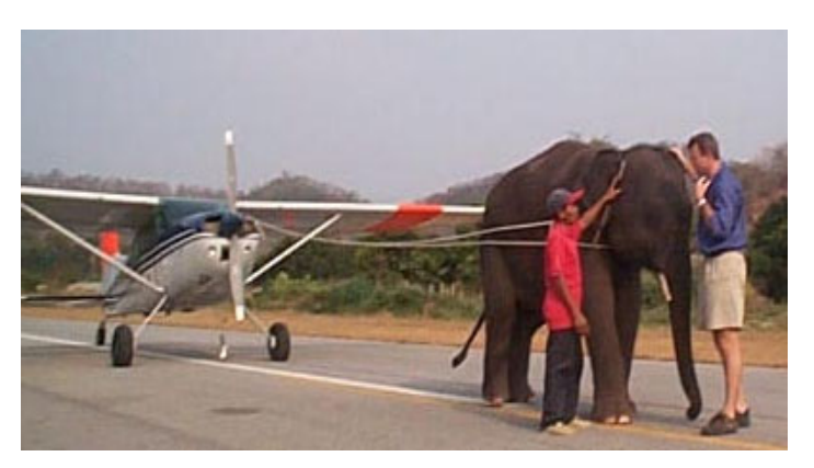
Ground Handling Thai style

Tower (without the slightest hesitation): "No, but if you ask your co-pilot, he can probably tell you."