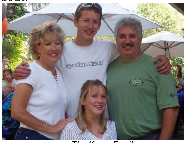
The Kerns Family

The Kerns are very happy to be PMLAA members and we are too!