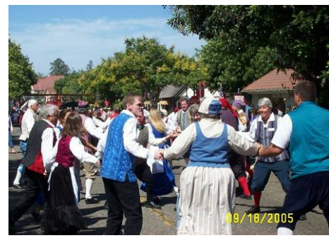
Folk dancing in the streets of Solvang