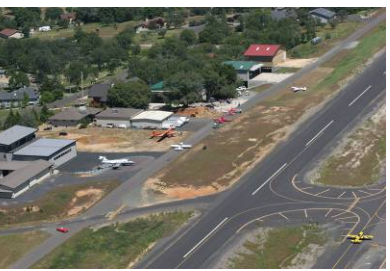
Our beloved strip