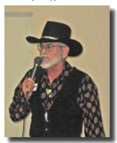
Our competent auctioneer