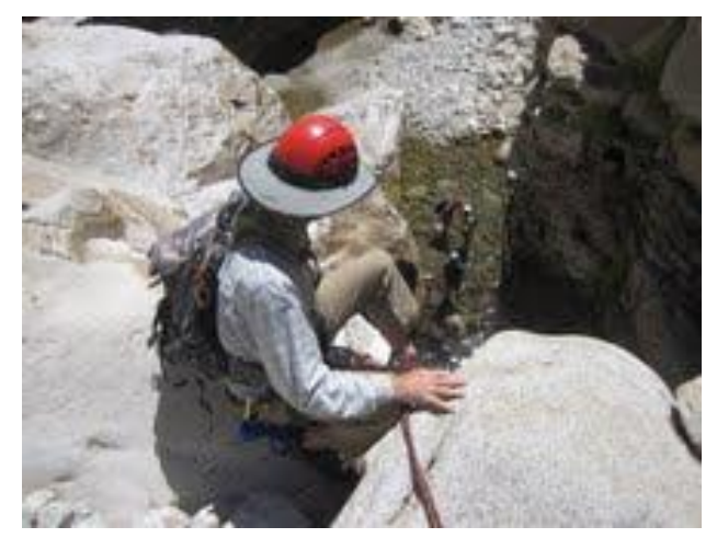
Their motto is "That others may live ... "

Rescue volunteers are on call 24 he's a day 7 days a week. Responding to back country ground searches, low angle and high angle rope rescues. They are trained in the areas of off highway vehicle, equestrian, air operations, swift water rescues and dive recovery. Whether in rain, sleet or snow, day or night, volunteers respond.