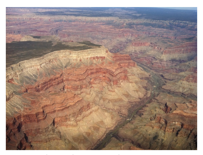
Grand Canyon via Cessna 172

I've only been a pilot for a few years, but have flown between the Bay Area and Kansas twice, traveled up to Montana by way of Portland, and had a fantastic ferry flight with my CFI as I picked up my new-to-me 2000 Cessna 172 in San Antonio, TX. My favorite memory from the trip home was the detour we took over the Grand Canyon. It was breathtaking! I fly for the views and the adventure of discovering the next neat airport or stunning view just over the horizon. I love to take photos of my travels tooaerials as well as landscape photography. Look for a picture or two of mine on these pages throughout the coming months.