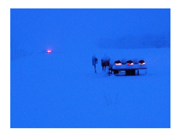
Runway 9 VASI

The FAA is providing no funding for airports to address the Through-The-Fence issue so all the work (past, present and future) must be funded out of the Airports Division budget. Additionally, since the access agreement between the County and the residents will have to comply with the yet to be released FAA Policy, it is risky at best to even draft any agreement. So, the bottom line is that work on resolving the RTTF issue is currently on hold pending the issuance of the FAA's Policy on RTTF.