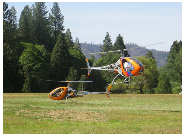
Helicopter Fly In at the Miller Ranch