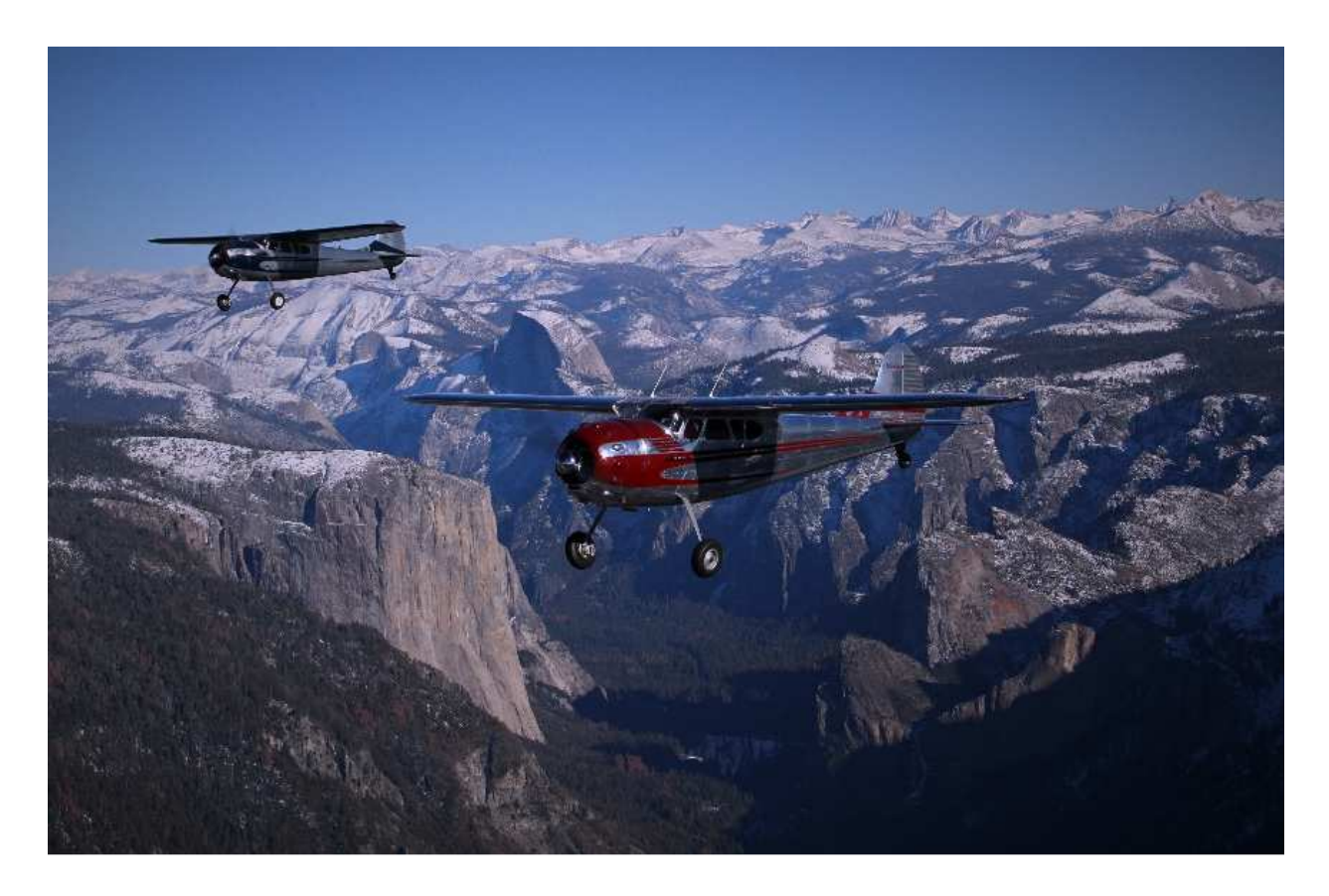
2017 Calendar Cover- Cessna 195s over Yosemite, by Rex Pemberton

After a long summer trying to hunt down photo opportunities, the 2017 PMLAA Calendar has been finalized. This edition features all aerial shots of airplanes, float planes, helicopters, and even a pair of powered parachutes.