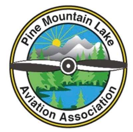
Volume 33: Issue 01 January 2018 A Publication of the Pine Mountain Lake Aviation Association