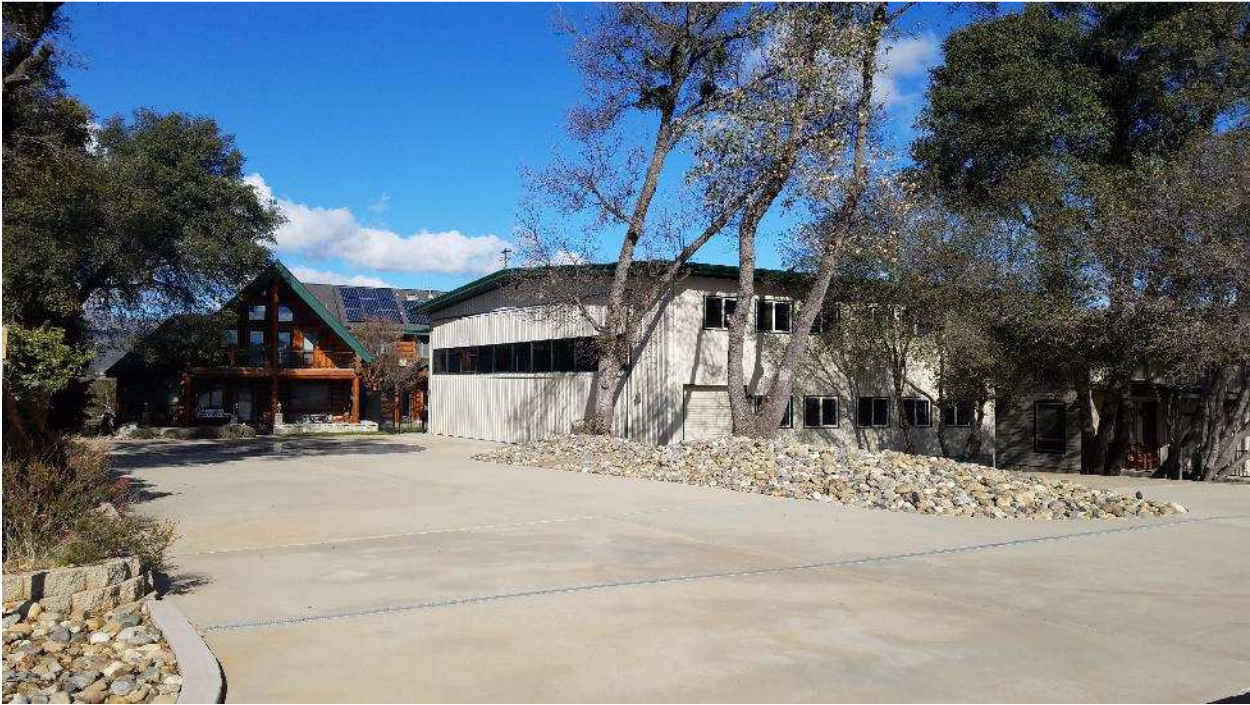
Benzing West Hangar