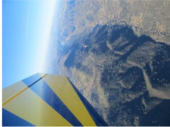
"Unusual Attitude" by Susie Williams

The Groveland Library Booknook is featuring the amazing photography of Susie Williams. The photo collection includes incredible aerial shots from San Francisco to Yosemite with many almond blossoms and Sierra poppies in between. Photos are on display for you to enjoy and even purchase. Susie's photos will be on display until the end of June in the Booknook, located in the lower level of the Groveland Library. The Booknook is open every Saturday from 9:00-2:00.