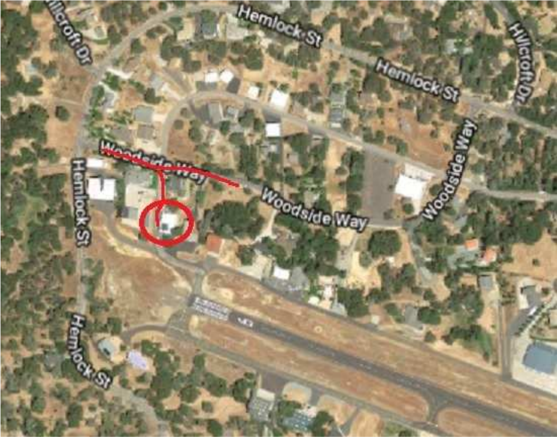
map to Duplan hangar