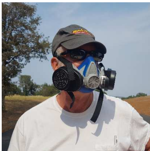
Smoke? What smoke?