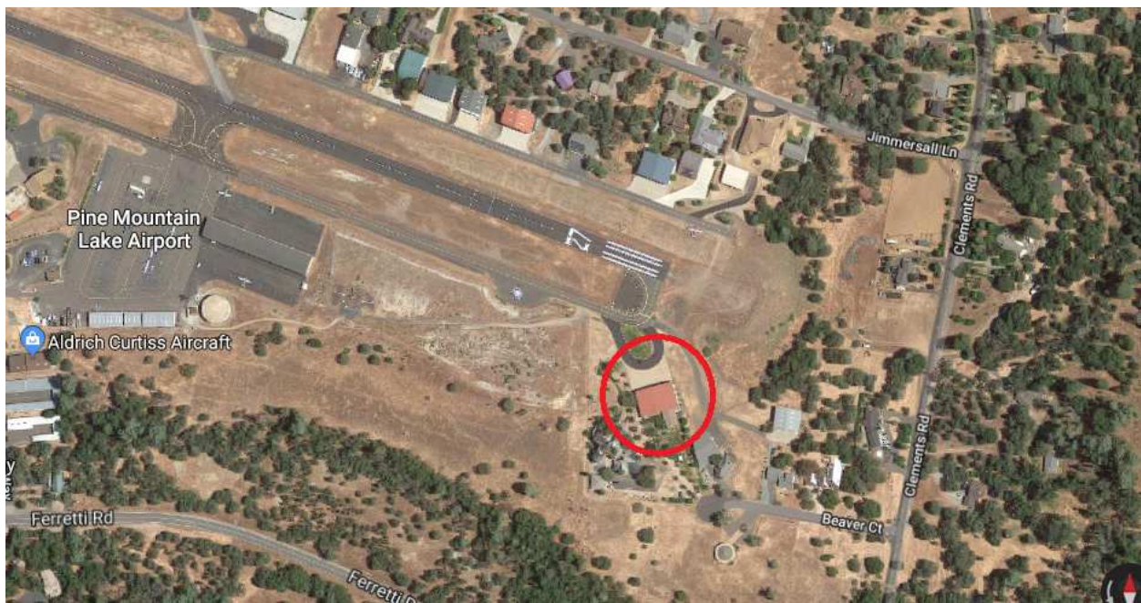
map to Gaudenti hangar