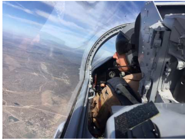
Colonel “Racer” Winslow

Colonel Winslow’s 37 military decorations include the Legion of Merit, the Air Force Meritorious Service Medal with 2 oak leaf clusters, Air Medal with 2 oak leaf clusters, Aerial Achievement Medal with 3 oak leaf clusters, the Air Force Combat Action Medal, Air Force Commendation Medal with 3 oak leaf clusters, Southwest Asia Service Medal with bronze star, Afghanistan Campaign Medal with 2 bronze stars, Iraq Campaign Medal with 4 bronze stars, Antarctica Service Medal, the Humanitarian Service Medal with bronze star, Air Force Combat Readiness Medal, Small Arms Expert Marksmanship ribbon (M16 rifle and M9 pistol), NATO ISAF (Afghanistan) medal, Delaware Conspicuous Service Cross, and the Louisiana Legion of Merit. He received the Malcolm C. Grow Award as Outstanding Air Force Flight Surgeon (ANG Command) in 1988 and the Air Force Association’s George W. Bush Award as outstanding Air National Guard officer in 2006. In 2019 Colonel Winslow received the FAA’s Wright Brothers Master Pilot Award. His aeronautical rating is Chief Flight Surgeon and he has logged 1150 military flying hours including 431 combat hours and 263 combat sorties. He has extensive operational experience in fighter, tactical airlift, and combat rescue missions. Aircraft flown include the F-4, F-15, F-16, CF-18, A-37, T-38, C-5, C-12, C-17, C-130, MC-130, C-131, C-141, E-3, KC-10, KC-135, UH-1, UH-60, HH-60, and CH-47.