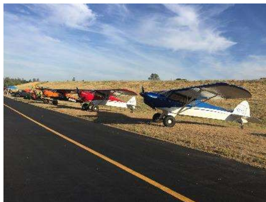
Aug 2019