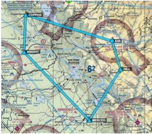
The Day's Route