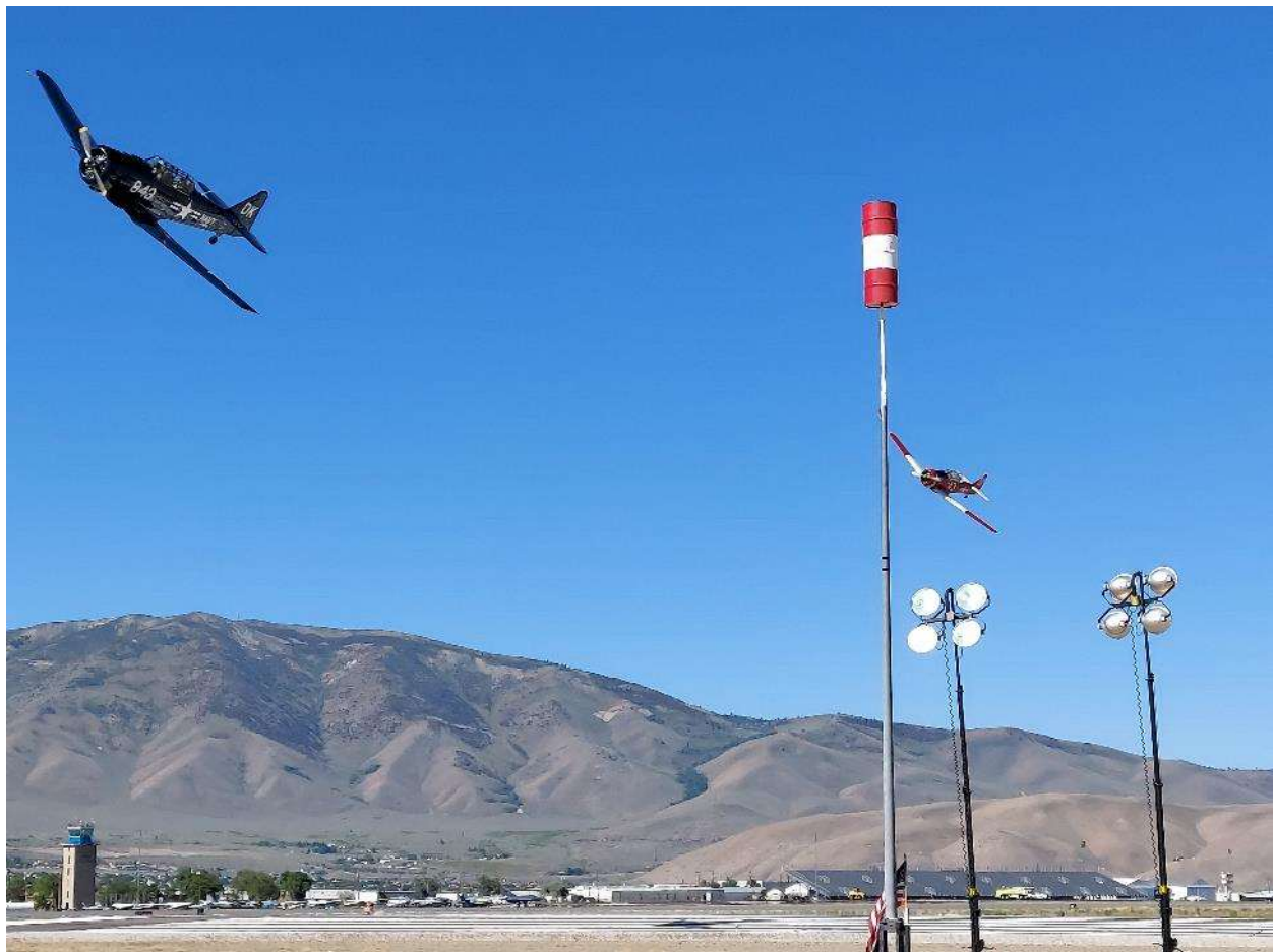
Reno Air Race T-6s