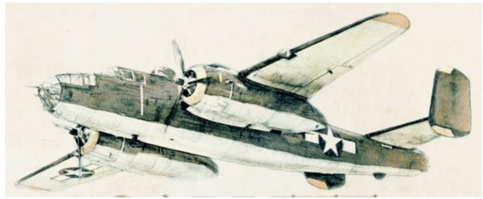
(U.S. Air Force graphic by Travis Burcham)

This historic event was depicted in the recent release of the movie "Midway" (2019) and the end credits noted that more than 10,000 Chinese civilians were tortured and murdered by the Japanese military for having assisted the Doolittle crew members during their escape after ditching or bailing out over hostile territory.