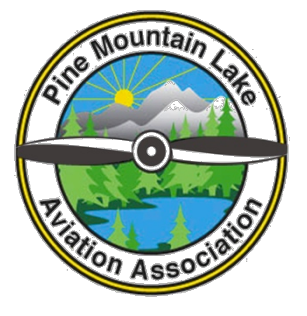
Volume 29: Issue 2 • February 2014 A Publication of the Pine Mountain Lake Aviation Association