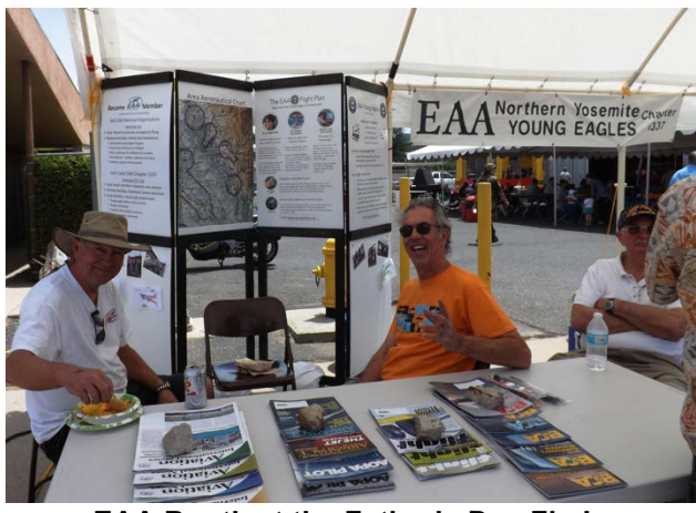
EAA Booth at the Father's Day Fly-In

October 4: EAA Young Eagles Rally & Airport Day at E45 Pine Mountain Lake