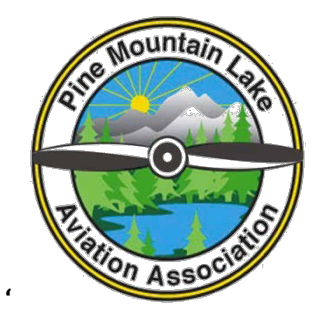
Volume 29: Issue 6 ● July 2014 A Publication of the Pine Mountain Lake Aviation Association