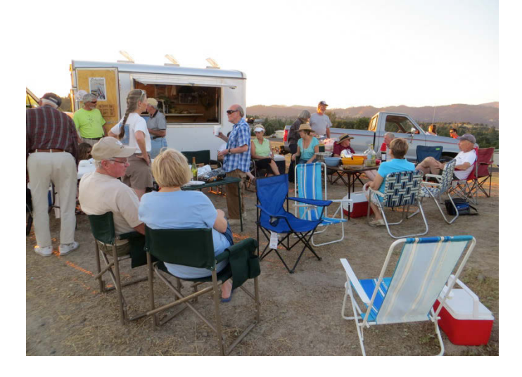
Wind Tee Party on July 4th