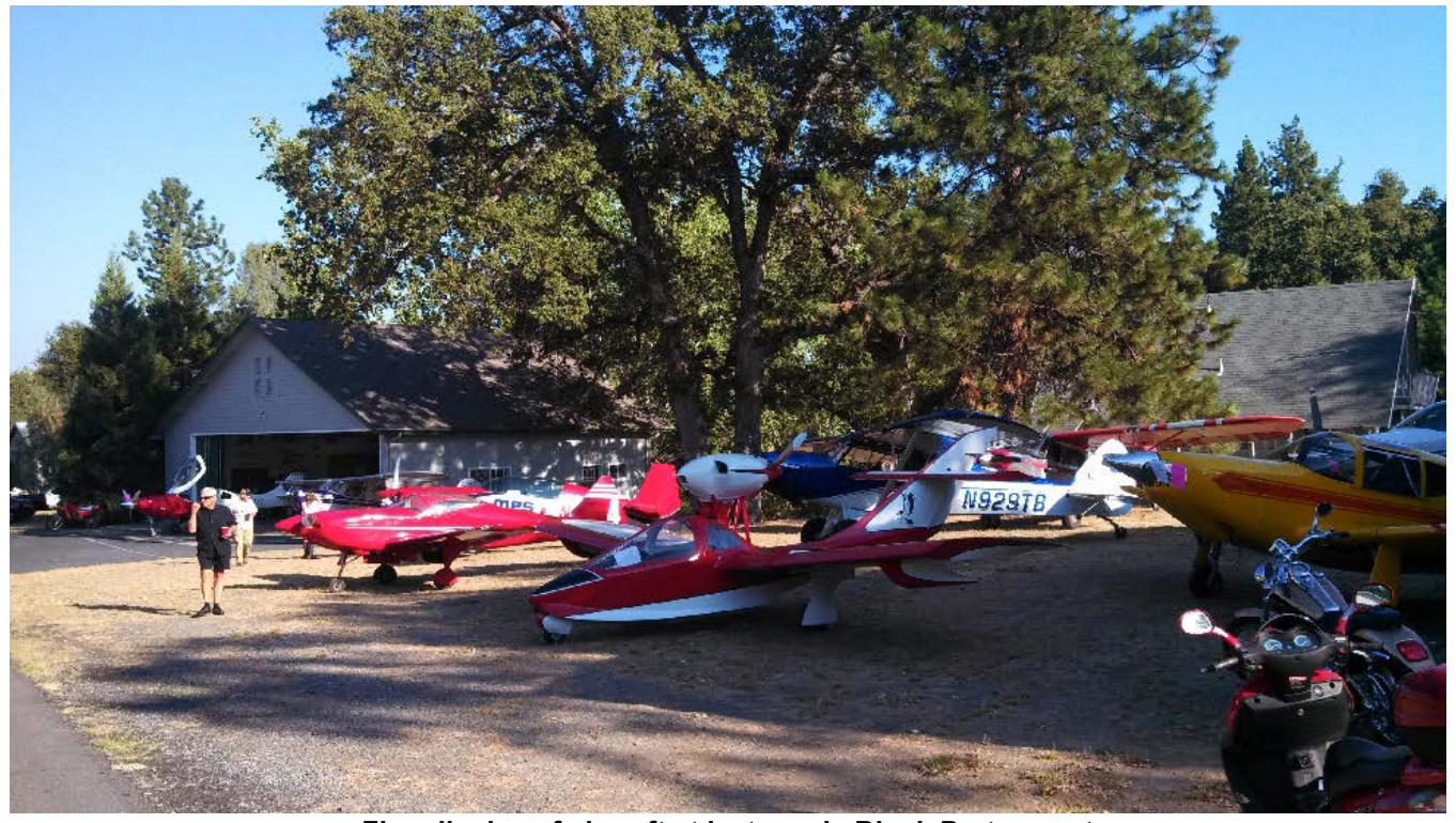
Fine display of aircraft at last year's Block Party event