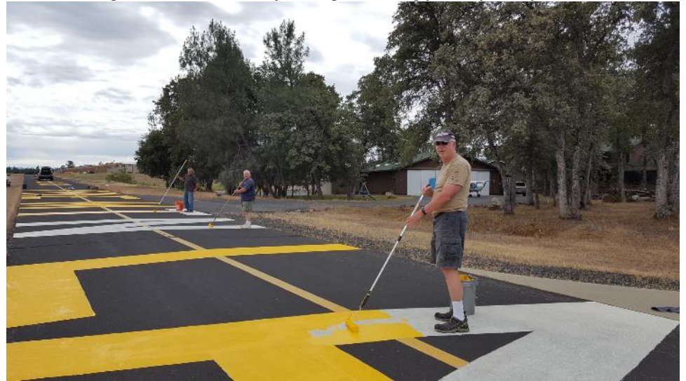
Volunteer Project - Painting the taxiway markings yellow

Visit <a href="www.aviation101.org">www.aviation101.org</a> to enroll and start your flight training journey today.