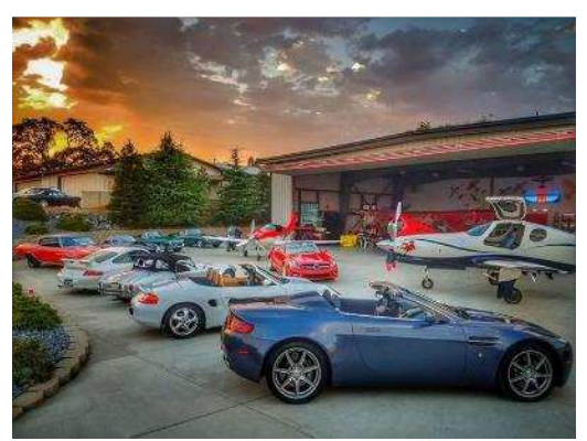
Vehicles at 2017 Hot August Nights

First off, I would like to shout out a huge THANK YOU to everyone who volunteered their help and homes to make the Northeast 27 Hot August Nights Taxiway Party a Success! I'd also like to thank our members and guests for all the great appetizers and desserts they brought. As busy as I was running around making it all happen, I still enjoyed seeing everyone enjoying themselves. I even got to dance a bit at the end of the night to that wonderful Columbia band.