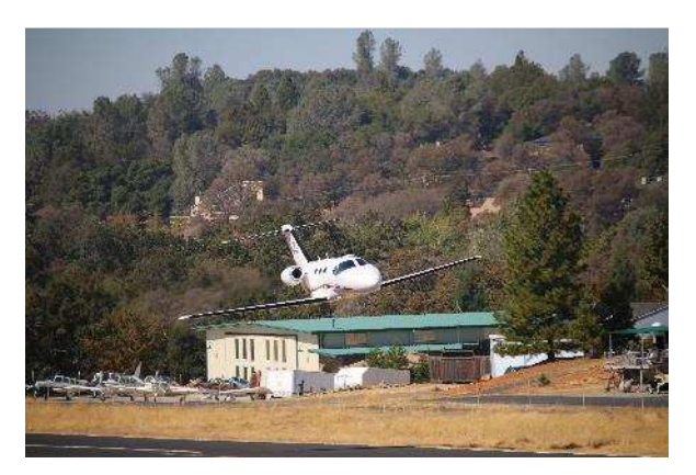
Alan's Citation Mustang jet